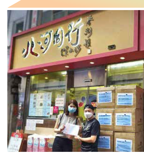
Pei Ho Counterparts