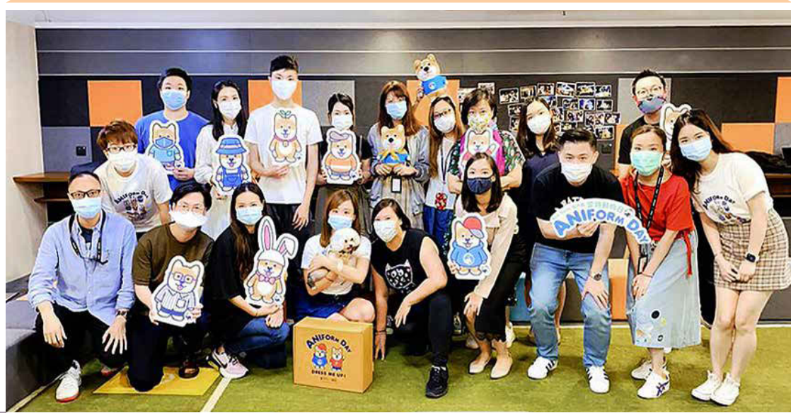
SPCA Aniform Day

In recognition of our continuous efforts, we have been awarded with the Caring Company Logo from the Hong Kong Council of Social Service for twelve consecutive years.