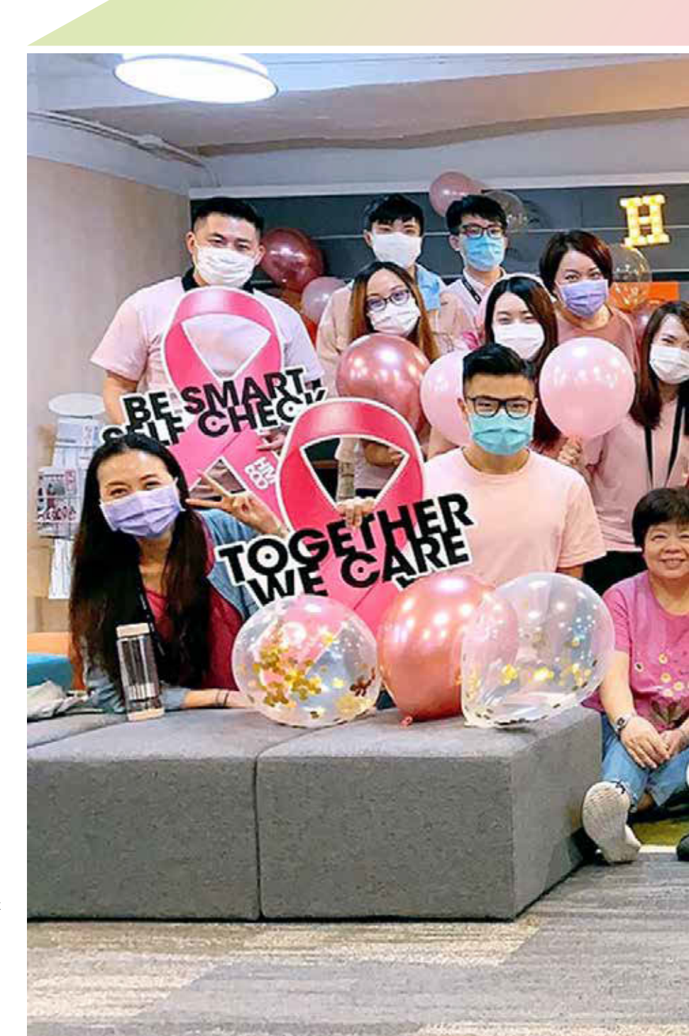
Dress Pink Day to support Hong Kong Cancer Fund

The Group's SRT was established in 2007, and ever since we have been taking part in various charity events, projects and donation drives. In 2020, we have recruited 106 volunteers and have contributed some service hours to visiting the elderly and providing interest classes to the community. Due to the restriction of the physical access to the premises requested by most of the associations, there was difficulty to serve our community on-site. We have also directly and indirectly donated around HK$39,410 in support of various charitable activities.