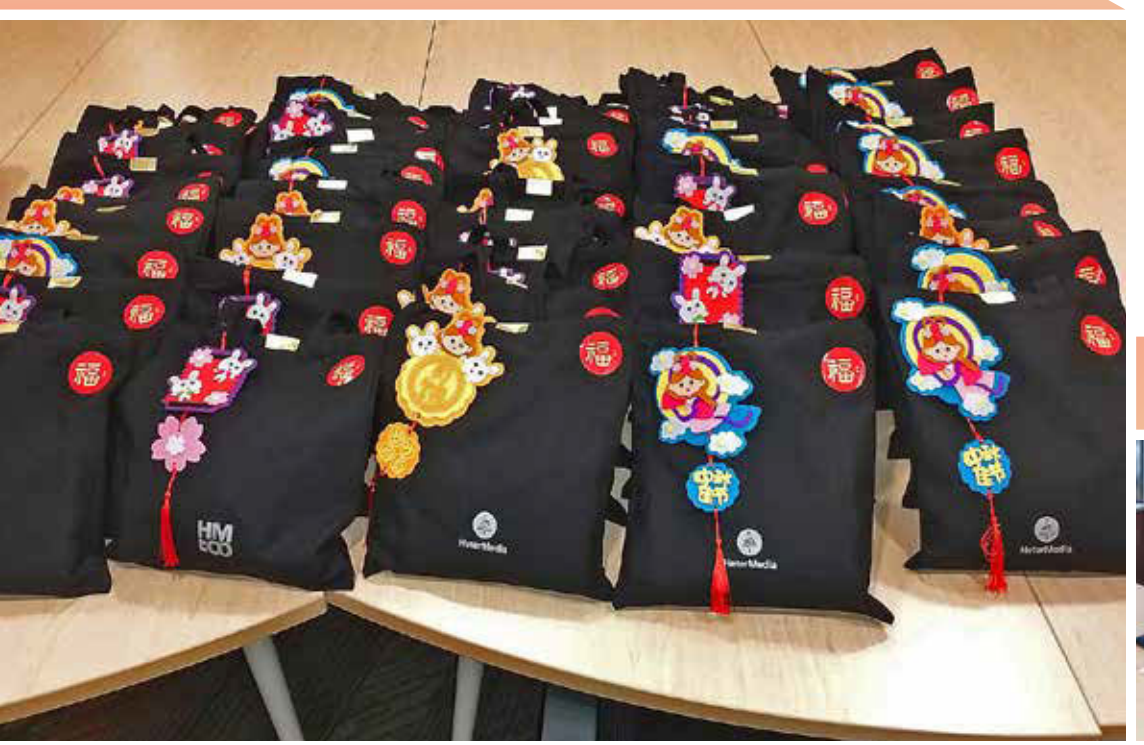
HM gift bag to Po Leung Kuk Elderly House on Mid-Autumn Festival